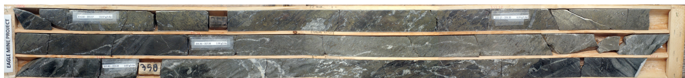
Plate 1: Core box containing the main mineralized interval in hole EM-14-001 from 354.6 to 359.1 m downhole, showing abundant pyrite as well as white iron-carbonate veinlets.

Globex drill holes from 2008 to 2015 were recently reviewed by Maple Gold's VP Exploration and were observed to exhibit multiple sulfide horizons, with variable amounts of associated iron carbonate and quartz, mainly within a strongly deformed sedimentary and pyroclastic package. Similar alteration and mineralization were also noted within weakly deformed subvolcanic mafic intrusives.