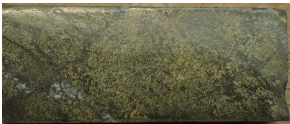
Plate 2: Semi-massive pyrite cut by iron carbonate veinlet (lower left) at 354.9 m in EM-14-001, part of a 1 m sample interval that gave 13.7 g/t Au.

https://orders.newsfilecorp.com/files/3077/90557_a03f9e53a4ef7b2d_002full.jpg