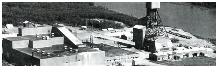
**Historical production figures provided to Maple Gold by Agnico Eagle Mines