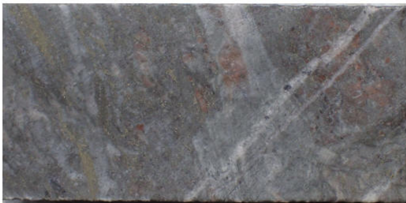
Figure 2: Sample of strongly altered and pyritised basalt with syenite fragments in interval grading 9.74 g/t Au; field of view 47.6mm.

To view an enhanced version of this graphic, please visit: https://orders.newsfilecorp.com/files/3077/46178_maple4.jpg