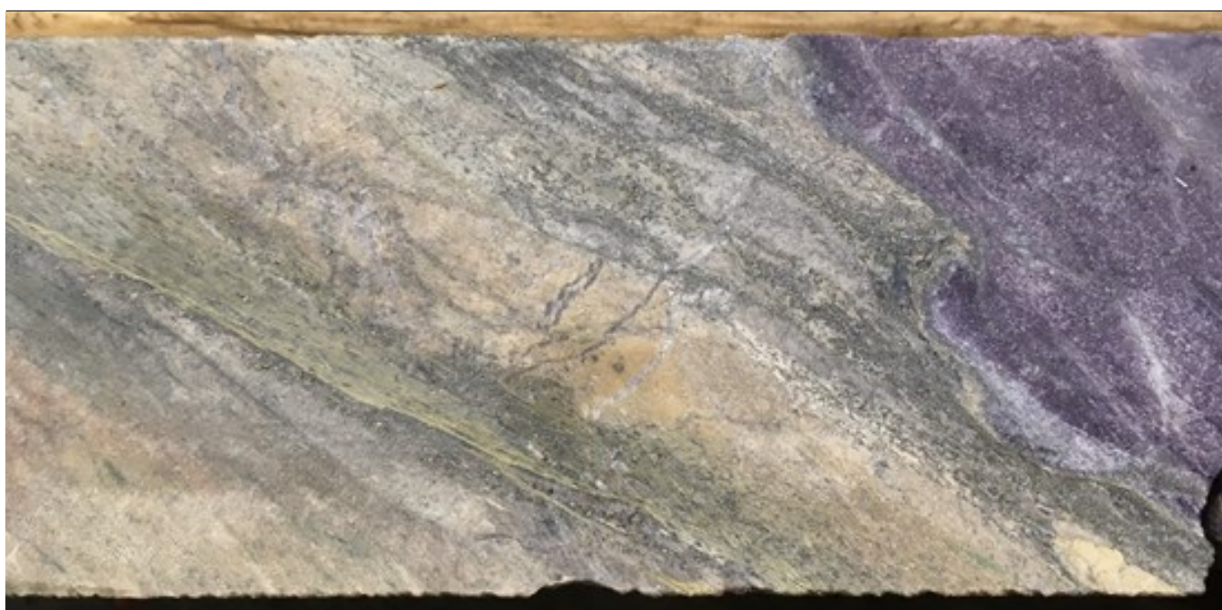
Fig. 3: NQ core (47.6mm diameter) from 41.3-41.9m in DO-20-272A, which assayed 13.25 g/t Au. Note yellow sericite defining foliation, stronger Fe-carbonate (pale orange color) and relatively abundant fine disseminated and stringer pyrite, as well as purplish grey fluorite-carbonate injection in upper right part of photograph.

https://orders.newsfilecorp.com/files/3077/55444_4e2260b9049bc905_002full.jpg