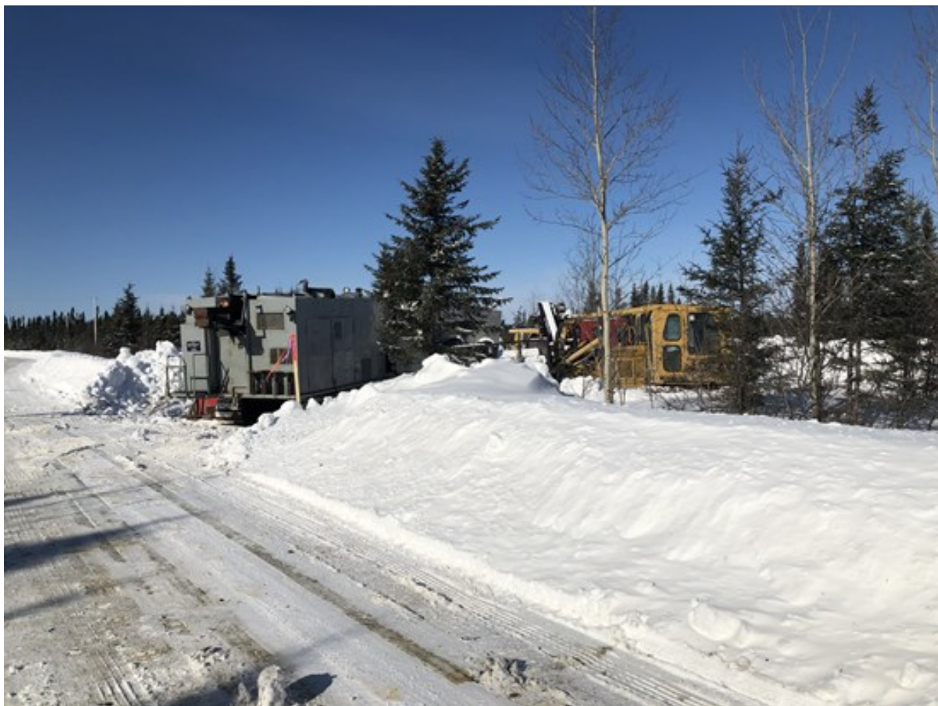
Fig. 2: Drill arriving at site, being mobilized to NW zone.

Not unlike at the 531 Zone, there has been no recent drilling within the NW Zone resource area, except for a few step-out holes collared outside the resource area in 2017 and 2018. As demonstrated by Maple Gold's 3D-model-guided drill-hole at the 531 Zone last year, the potential for new ideas and updated interpretations to lead to the discovery of significantly broader and higher grade mineralisation is high at the Douay Project. The hole to be drilled here is a step-out hole meant to expand the NW zone resource area to the west, by testing the western continuity of an adjacent near-surface high grade intercept averaging 3.15 g/t Au over 8.9m from 41m downhole, significantly higher grade than the current resource at the NW Zone of 2.6 mt @ 1.14 g/t Au for 96,000oz Au (RPA 2019).