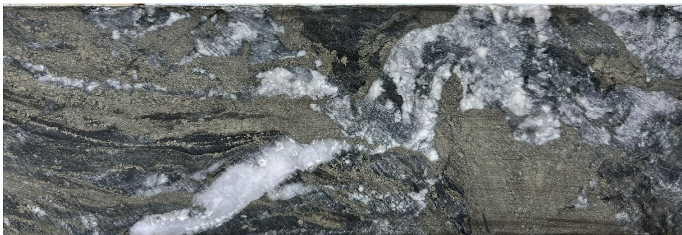
Plate 1: Semi-massive pyrite with iron-carbonate veinlets at 346.5 m downhole in drill hole EM-22-005 (#5 pierce point shown on Figure 1); mineralization extends from 346 to 363.5 m downhole. Assays are pending; NQ core (47.6mm diameter)

To view an enhanced version of Plate 1, please visit: